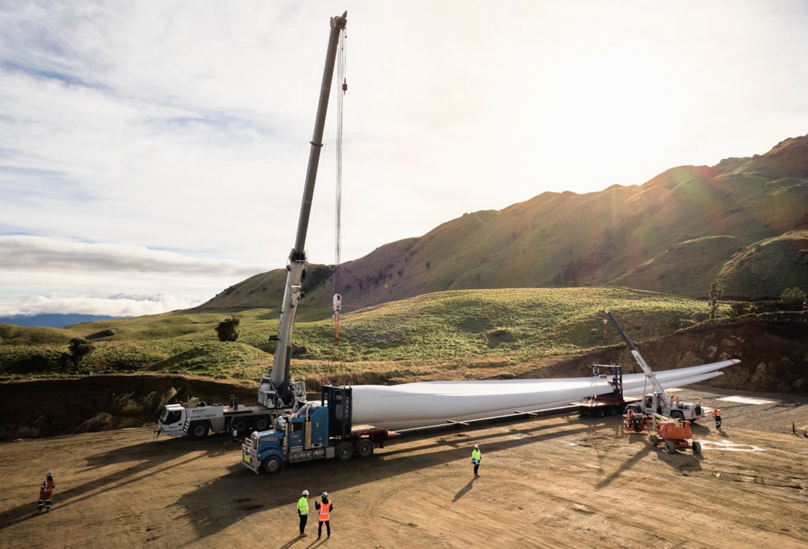
Harapaki wind farm construction, Hawke's Bay