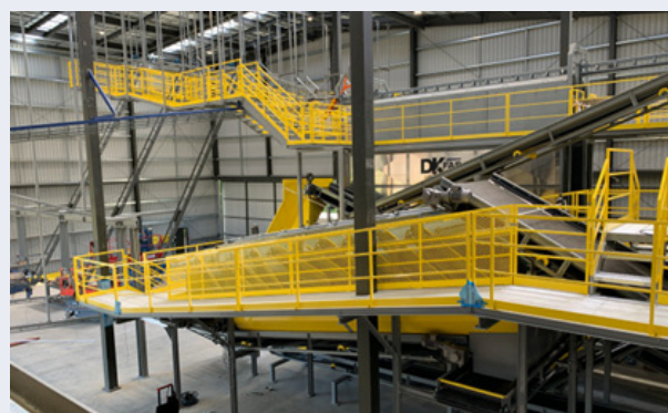
Waimea West Hops new processing facility.

These new facilities will significantly increase the processing capabilities and will also allow Waimea West to process hops for third parties in addition to its own adding the potential for additional revenue streams.