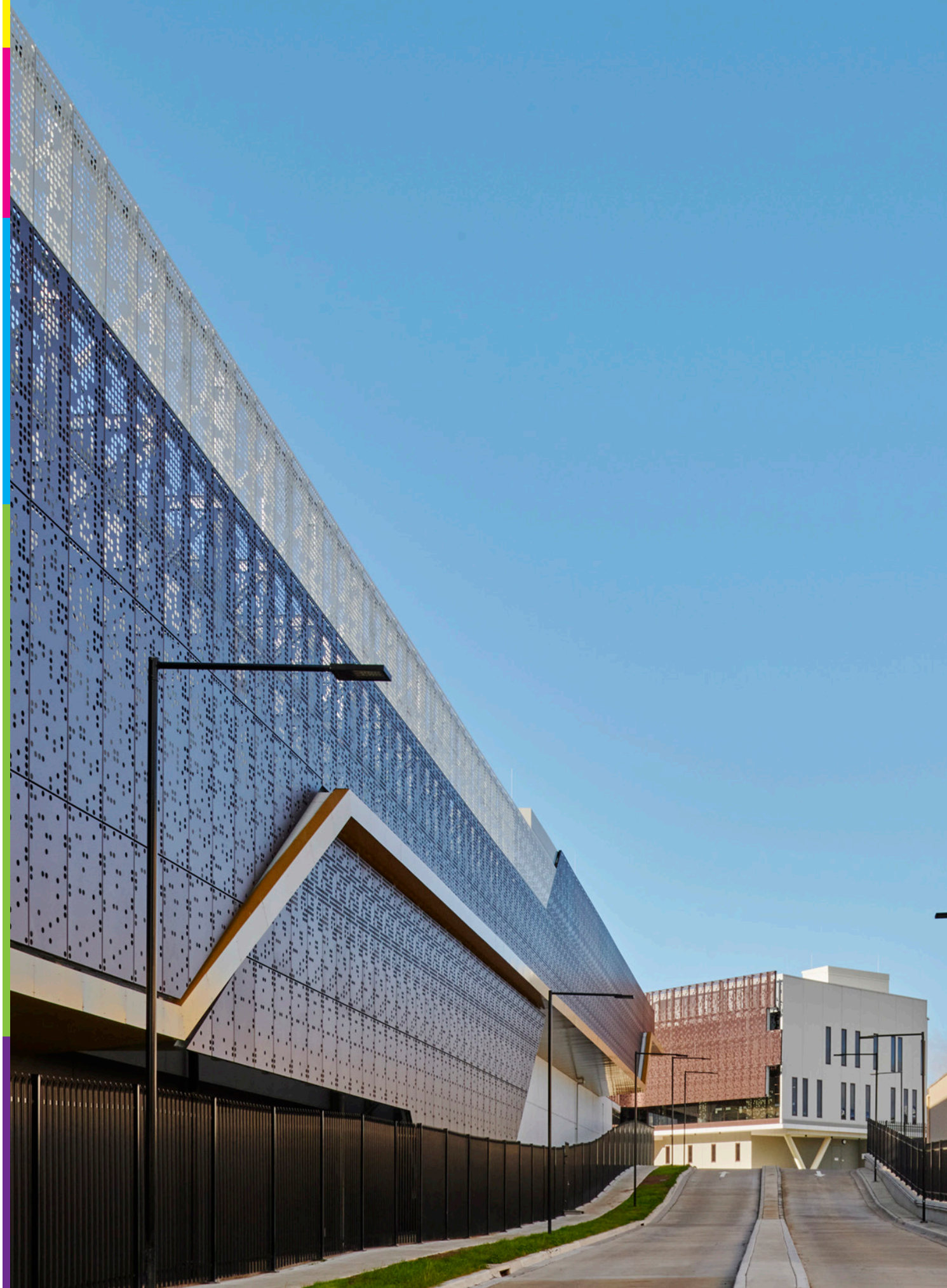
CDC Hume Campus