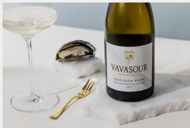
Vavasour Awatere Valley, Marlborough