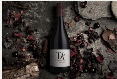
Te Kairanga Martinborough