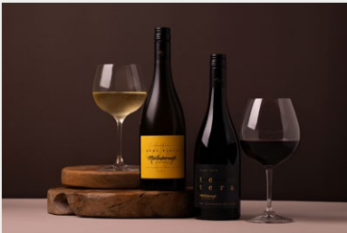
Martinborough Vineyard Martinborough