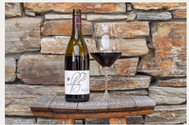
Mt Difficulty Central Otago