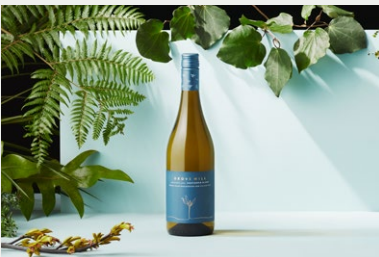
Grove Mill Wairau Valley, Marlborough