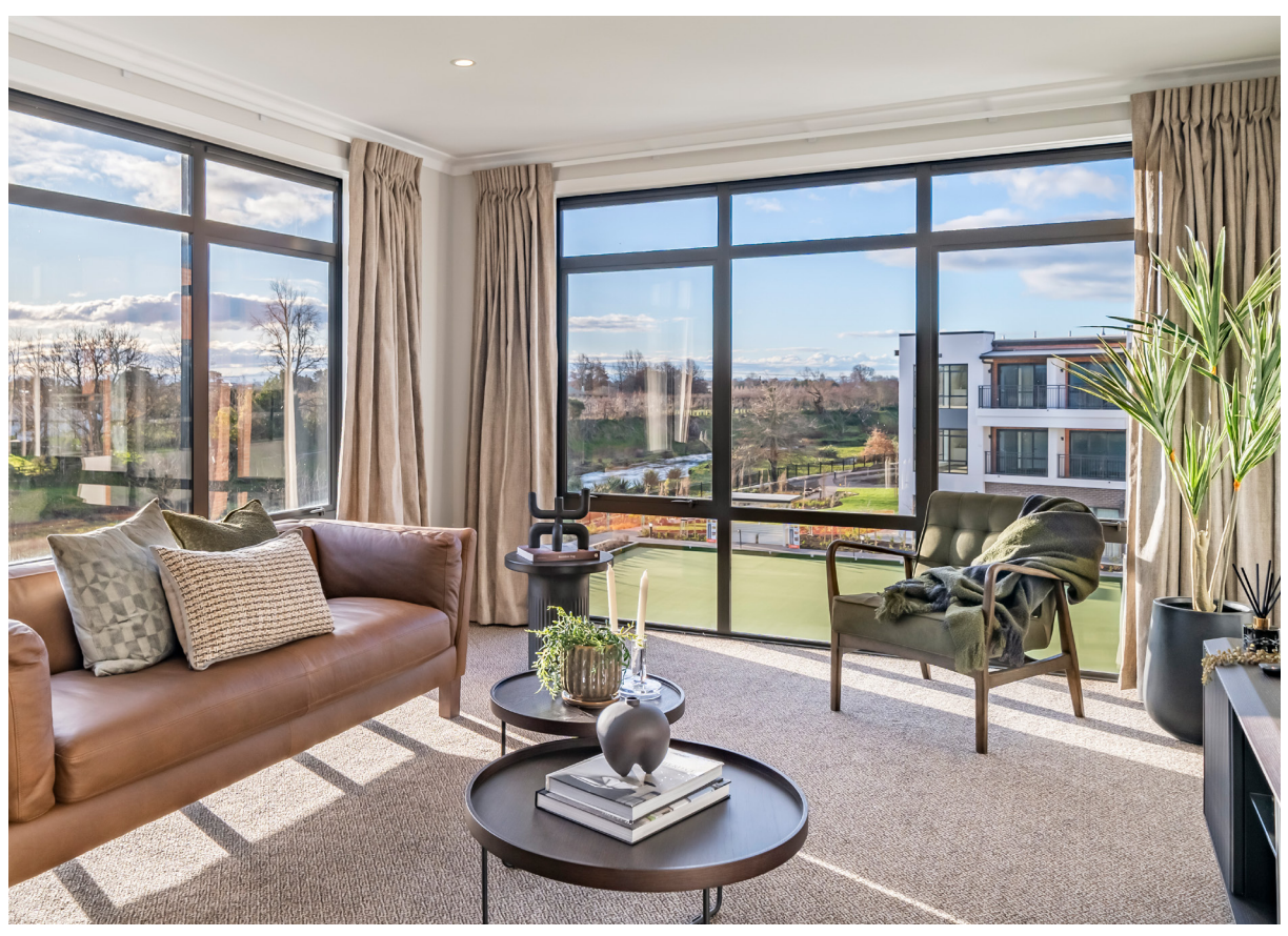
James Wattie Village

Capitalised terms used in this Offer Document have the meanings given in Part 5: Glossary.